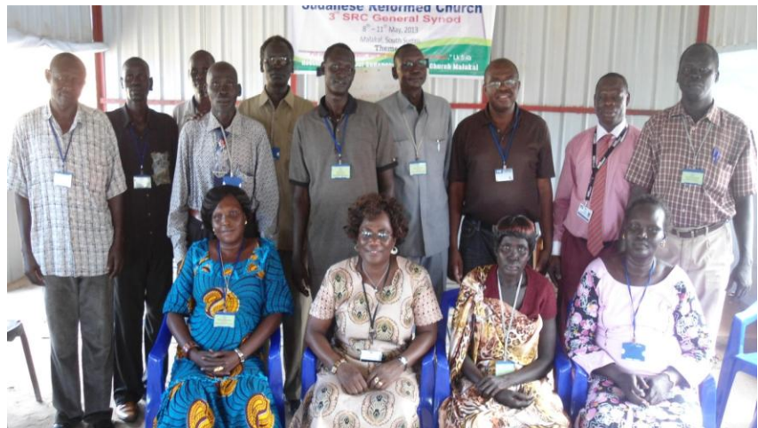
SRC delegates who have committed themselves to be peace makers

South Sudan had been in war for 55 years. The notable features of people daily life are war trauma, violence, tribal tension, mistrust, and cattle raiding just to mention a few. Thus the leadership has envisioned that SRC should play her role in bringing reconciliation, healing and