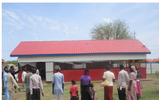
Immanuel Sudanese Reformed Church Malakal, South Sudan