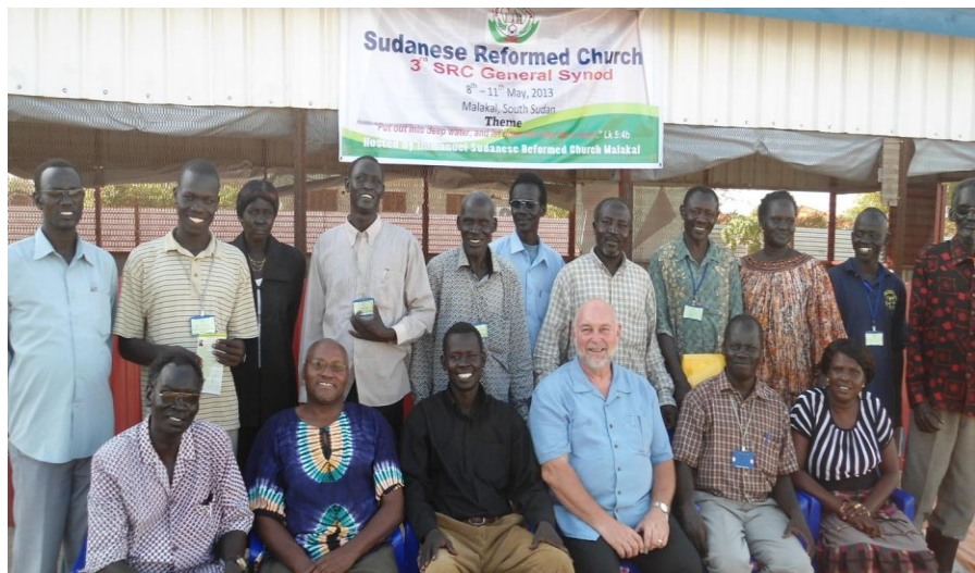
3 rd SRC General Synod delegates in Malakal

Sudanese Reformed Churches (SRC) started in Khartoum, Sudan in 1992. In God's grace SRC has grown into (16) churches all over South Sudan and Sudan with (12) ordained pastors and (17) evangelists. On February, 2005, the four house fellowships in Khartoum were organized as Christian denomination under the name "SUDANESE REFORMED CHURCHES". Further on 31 st October, 2005, a committee was formed to provide leadership. Belgic Confessions, Heidelberg Catechism Canons of Dort and Reformed Church Order were adopted as the confessional, doctrinal and structural basis of the denomination. The 1 st Synod of SRC was held in Khartoum on 17 th – 18 th April, 2009 while the 2 nd SRC General Synod was held in Juba 27 th April to 5 th May, 2011. In SRC strategic Plan (2011-2015), it is hoped to plant 36 more churches: 25 in South Sudan and 11 in Sudan.