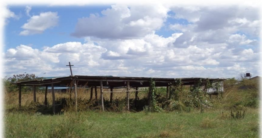
JSRC worship center destroyed during 2013 crisis in Juba