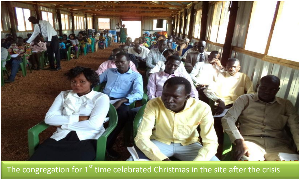
The congregation for 1 st time celebrated Christmas in the site after the crisis

Due to instability in the country, JSRC is becoming a key congregation of SRC replacing Immanuel Sudanese Reformed Church in Malakal which used to be the leading congregation before late 2013. All SRC resources are now being focused on Juba which is hoped to be SRC hub.