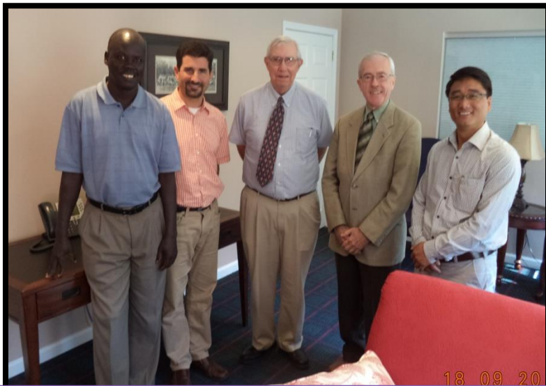
Some of OPC leaders with representatives from Sudan and North East India during ICRC WMC meeting

SRC participated in ICRC Missions Committee consultation which was held in September 16-17, 2015 at Orthodox Presbyterian Church Headquarters, Willow Grove, Pennsylvania. It was a